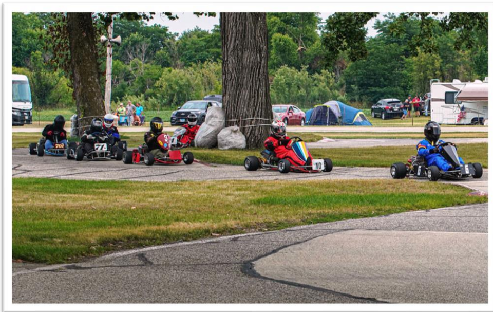
Yamaha Piston Port Action in 2023