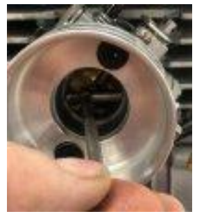
136.2.1 remove carb and check throttle bore 1.010" no-go